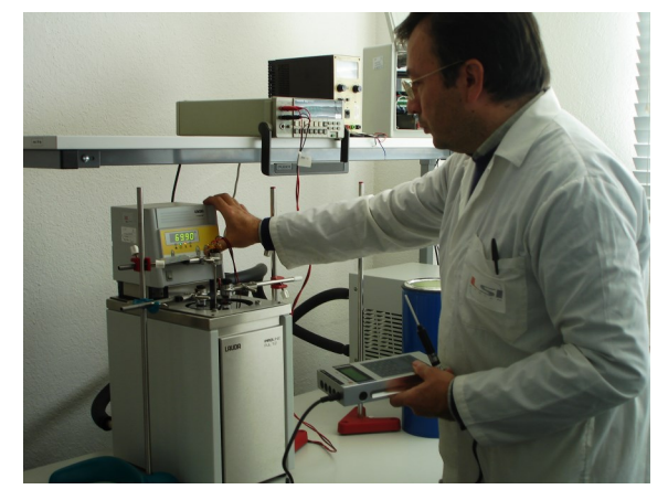
LSI LASTEM is an ISO17025 accredited laboratory for temperature measurements. All sensors manufactured are tested inside our laboratory. LSI LASTEM provides Test report for any sensor and, under request, ISO17025 or ISO9001 calibration certificates (see Accessories list).