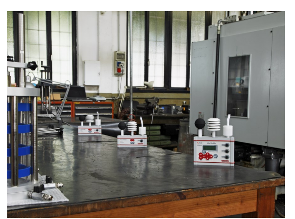
Assesments in three positions of the same environment