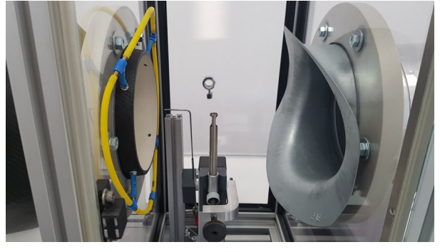
LSI LASTEM is an ISO17025 accreditated laboratory for air speed measurements. All sensors manufactured are tested inside this laboratory. LSI LASTEM provides Test report for any sensor supplied and on request, ISO17025 or ISO9001 calibration certificates (see Accessories list).