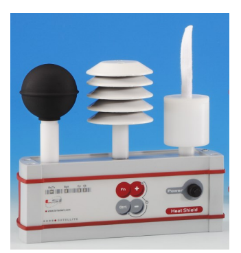
ELR610S: 5 cm diameter black globe sensor satellite modules

Heat Shield can be supplied as a single base unit or with additional two wireless satellite modules (ELR610S, ELR615S). The satellite units are used to measure environmental conditions at three positions or levels and calculate Head-Torso-Ankle Weighted Average WBGT as required by the ISO 7243. Heat Shield radio can cover up to 300 m in line-of-sight distance, in indoors conditions it may vary.