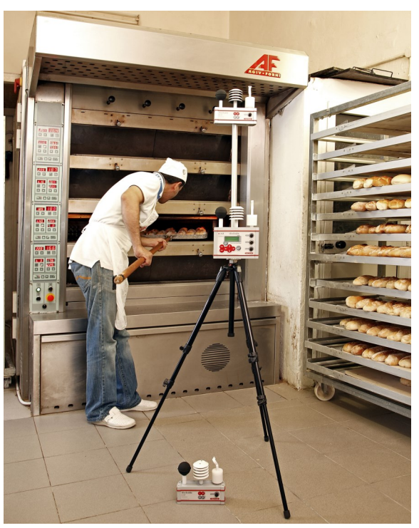
Three levels WBGT on the same vertical