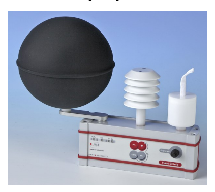
ELR615S: 15 cm diameter black globe sensor satellite modules